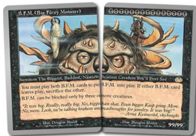
A use for Cabal Ritual!

Of all the ideas that rushed to my head, the most exciting one was the idea of making a giant card. A card so big that it required two physical cards to create it. Before the meeting was over, I realized that this card should be a creature. Thus was born B.F.M. ( left side/right side ). At 99/99, it's the largest creature we've ever printed (by a rather healthy margin, I might add).